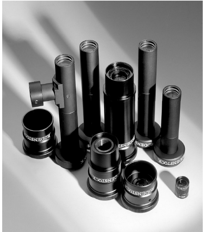
Macrolenses for CCD-cameras and magnification ratios from 1:7 to 8:1 (related to the image size on the CCD chip)

Macrolenses developed by Rodenstock Präzisionsoptik for CCD cameras feature the highest resolution, excellent contrast, color neutrality and are virtually distortion-free.