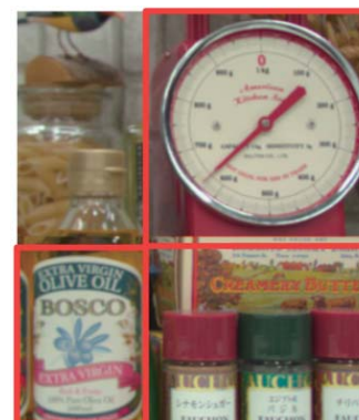
ROI mode (After cropped)