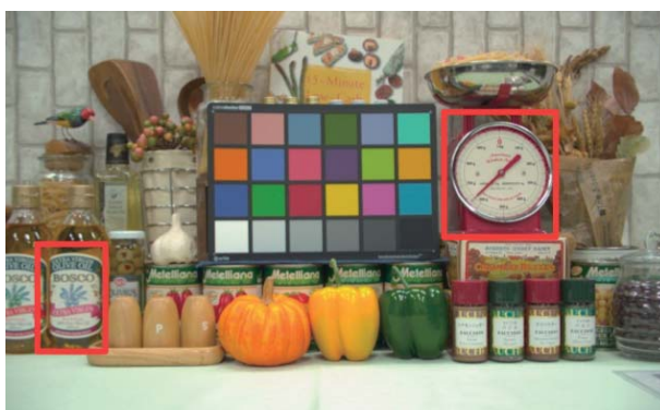
ROI mode (Cropping areas)

Condition: 2000 lx F5.6 (UXGA image ADC 12 bit mode, 60 frame/s, internal gain 0 dB)